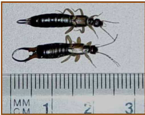
Figure 1: Female (top) and male (bottom) adult European earwigs. (sourced from Cotsaris, D., et al, Fact Sheet No. 6 European Earwig, CCW, Berri, SA)

Earwigs are commonly found during the day sheltering beneath the bark of vines, inside cracks and holes of posts and strainers, and under debris on the vineyard floor.