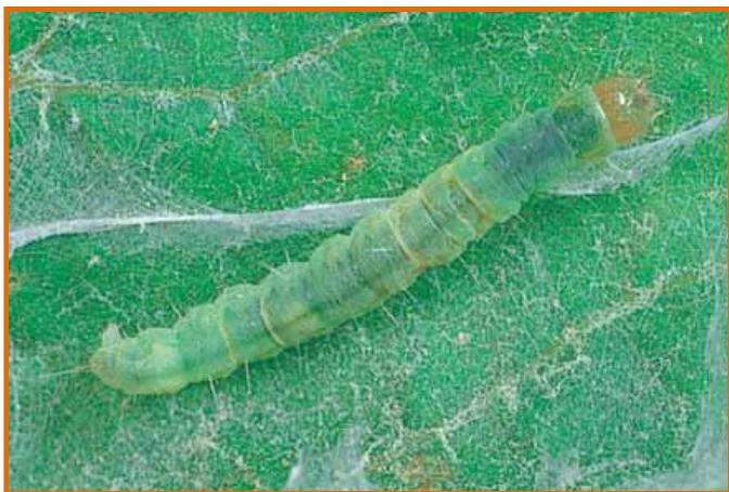
LBAM Second Instar – look for these in the shoot tips.