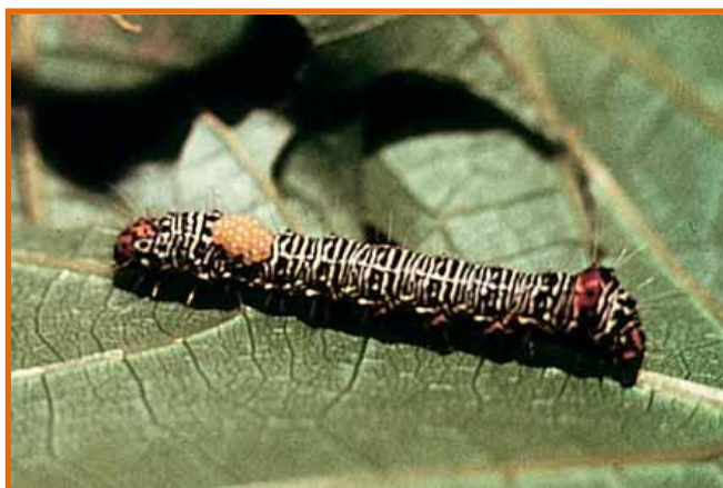
Damage from Grape Vine Moth and its caterpillar appears in some vineyards. It is worth looking for this at this time of the season.

----- This message was prepared for The Clare Region Grape Growers Association by Magarey Plant Pathology and Western Electronic Design. -----