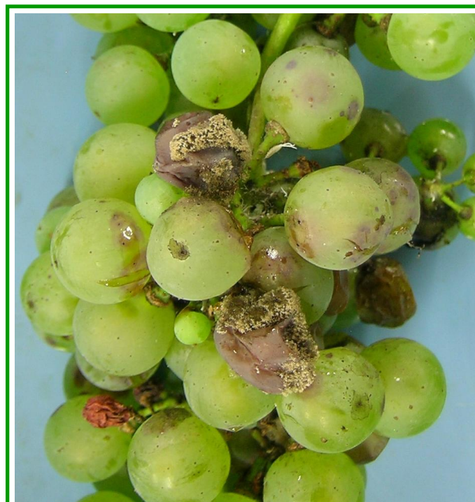
Typical Botrytis Bunch Rot on Riesling berries following the recent rains. Extended periods of leaf and bunch wetness at nearly ideal temperatures led to the growth of the buff-coloured fungal spores that have already spread the disease to adjacent berries. New Bunch Rot symptoms will soon appear unless the canopy dries out quickly.