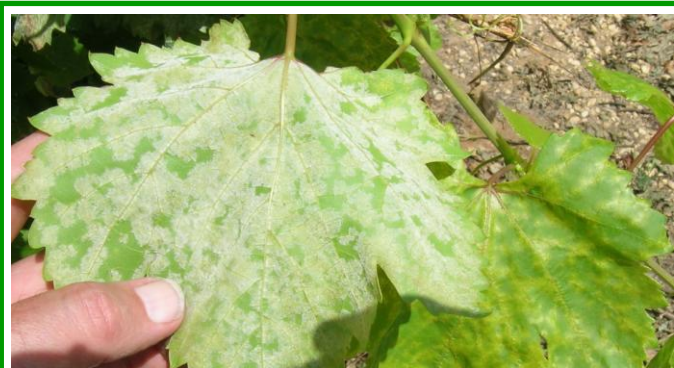
The white down of Downy Mildew developed on the undersides of the yellow oilspots in a massive sporulation event – as part of the secondary infection highly likely during the recent wet weather.