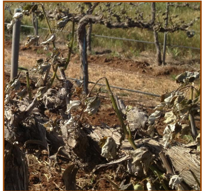
Shoots killed. Freeze (frost) damage on soft young foliage in a badly affected vineyard in the Barossa Valley floor after the heavy frost on Monday night – Tuesday morning. Secondary and tertiary buds at the base of these shoots will soon produce new shoots and a low-yielding, delayed second crop.

The results have suggested that none of these efforts are cost effective in most vineyards, except