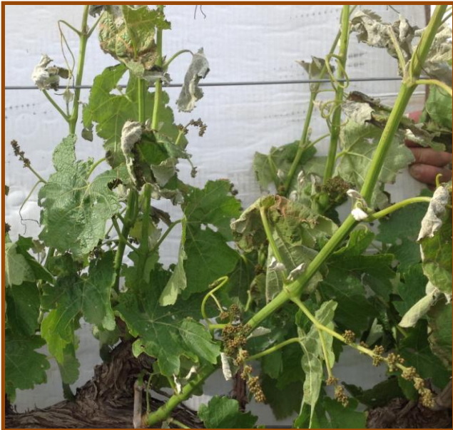
Shoots less damaged with some flower buds (inflorescences) damaged and some killed. As bad as they look, some of these shoots and young 'bunches' will survive and produce a crop – although, naturally enough, at reduced yield.

(pruning costs), this season's yields are likely to be very low and at times, there may be two distinct maturity dates as the 'second crop' ripens later than remnant bunches from the present crop.