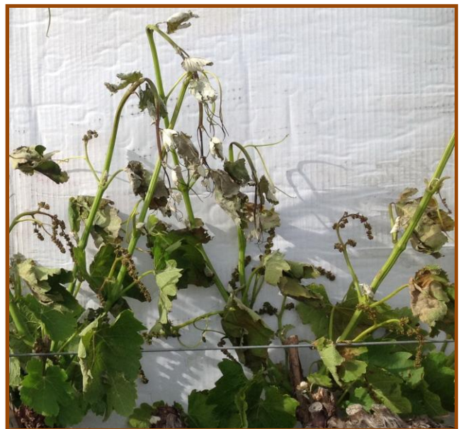
Shoots damaged with upper leaves, shoot tips and most bunches killed by the frost in the Barossa Valley on Monday night – Tuesday morning. Buds from low on the shoots will produce new shoot growth (and few fruitful buds) in about 10 days.

perhaps in vineyards with fruit for high priced markets. Even then, the value of the treatments was doubtful because, despite the extra inputs